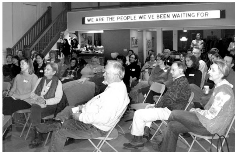
On a cold night in February, Linden Hills block captains learned more about the upcoming Linden Hills Power & Light composting pilot project.