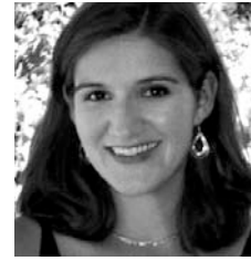
Notes from the LHiNC Chair — continued from cover

If you are a neighborhood resident interested in serving on the task force as one of the two at-large members, please contact Linea Palmisano at 612.819.5871.