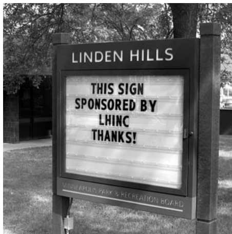
New sign at LH Park says it all.

Did you notice the new Linden Hills t-shirts at the Linden Hills Festival? They are available in a variety of colors and children and adult sizes. The all-cotton t-shirts were printed locally, and are sweatshop-free. Proceeds go back into LHiNC neighborhood efforts! Shirts are available for $15 by contacting board member Kelly Keegan at keegoo09@umn.edu or 612.827.8020.