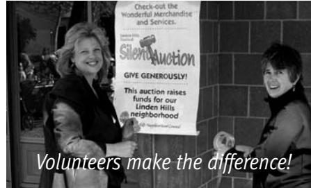
Volunteers make the difference!

block level—and as I write have the most registered National Night Out events of any neighborhood in Minneapolis. Long-term, we are changing from an organization focused on the use of the Neighborhood Revitalization Program (NRP) dollars into a sustainable, neighborhood-serving non-profit. This means