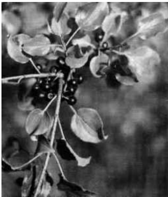
Buckthorn leaves and berries

The Environment Committee will help pay for replacement of your buckthorn